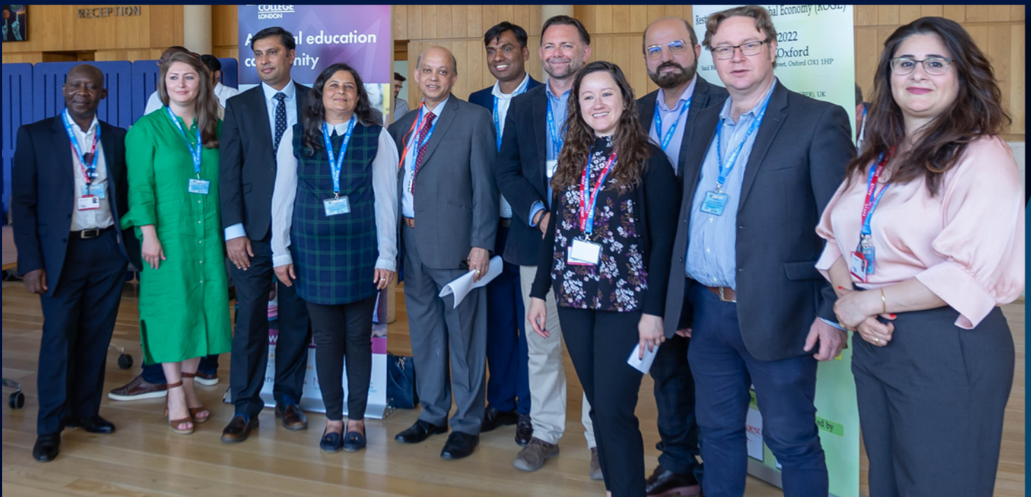
11th International Conference on the Restructuring of the Global Economy (ROGE) 2022

The maximum benefit of attending this international conference shall be to researchers, academics, management consultants, corporate professionals, corporate trainers, government officials, representatives of think tanks, social service organizations, entrepreneurs, doctoral and master's students.