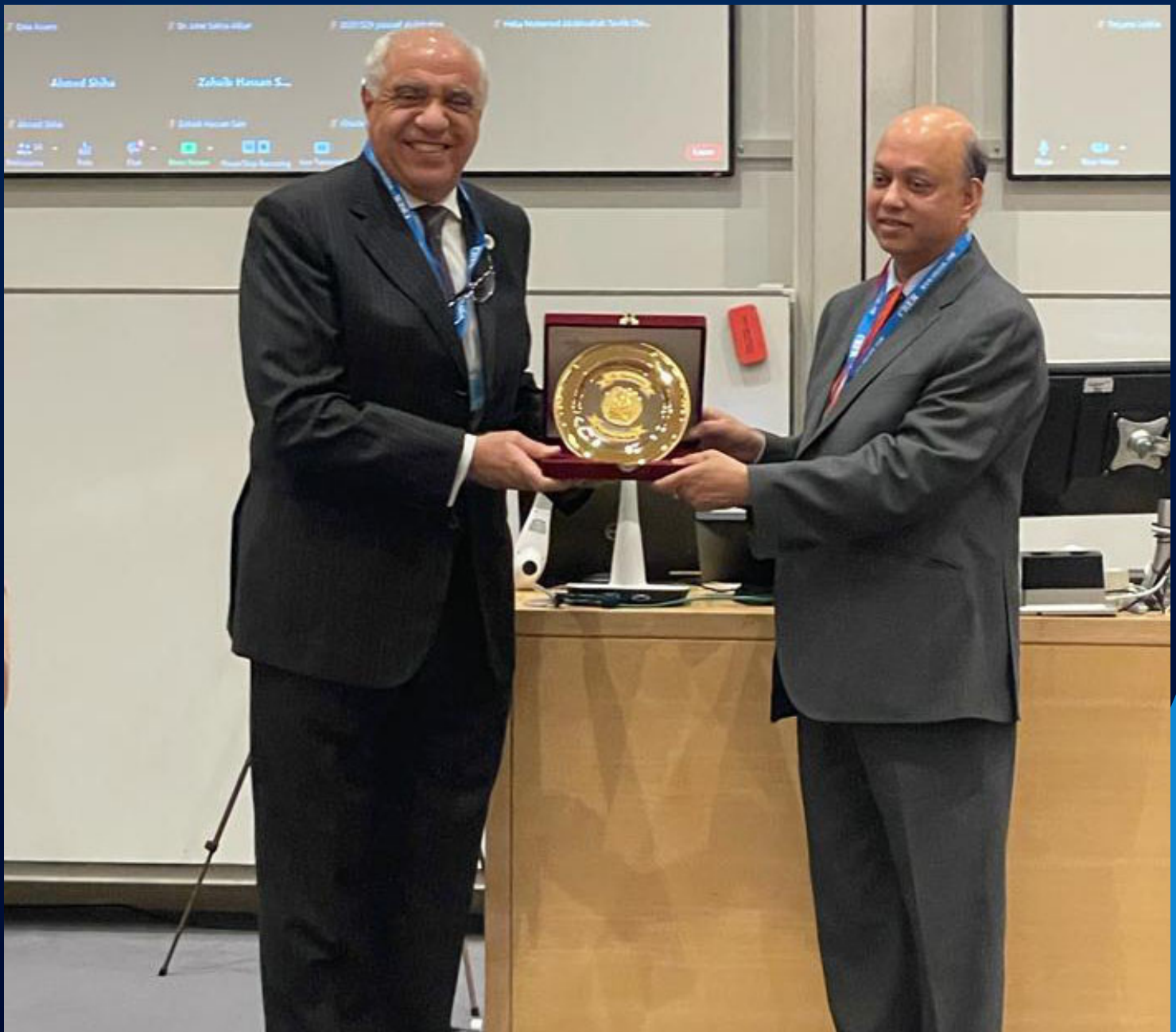
11th International Conference on the Restructuring of the Global Economy (ROGE) 2022