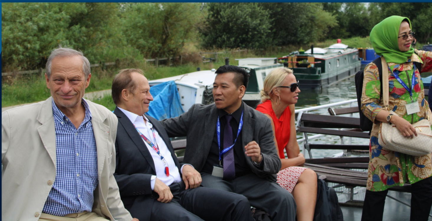
Boat Journey, ROGE July-2019 Oxford