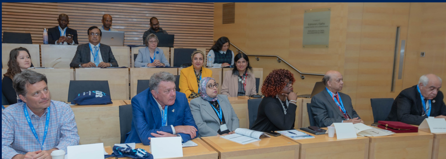
11th International Conference on the Restructuring of the Global Economy (ROGE) 2022

UNIVERSITY OF OXFORD, SAID BUSINESS SCHOOL, PARK END STREET, OXFORD OX1 1HP