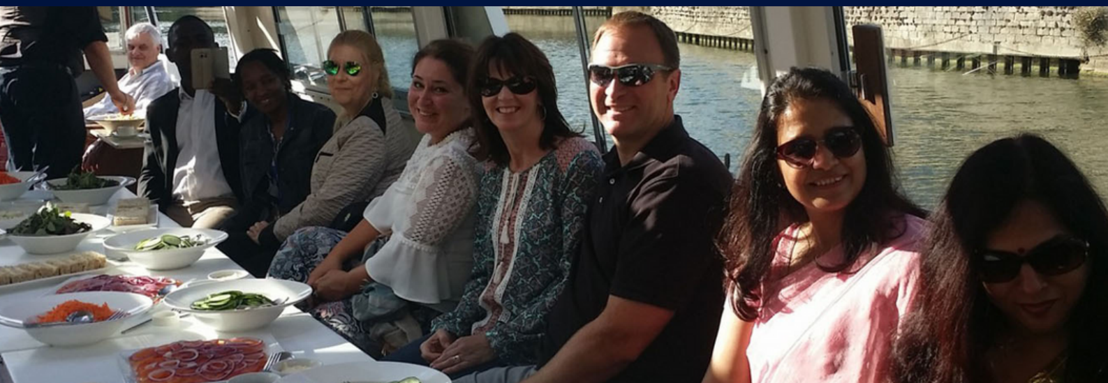
ROGE-2017 at the University of Oxford, Rive Cruise

We must all be open to new ideas. Unfortunately, many of us have allowed ourselves to become ideologically/intellectually cocooned, to the point where some of us have yet to comprehend how events such as the Brexit result and similar momentous events came about. This conference provides an excellent opportunity for us to broaden our horizons.