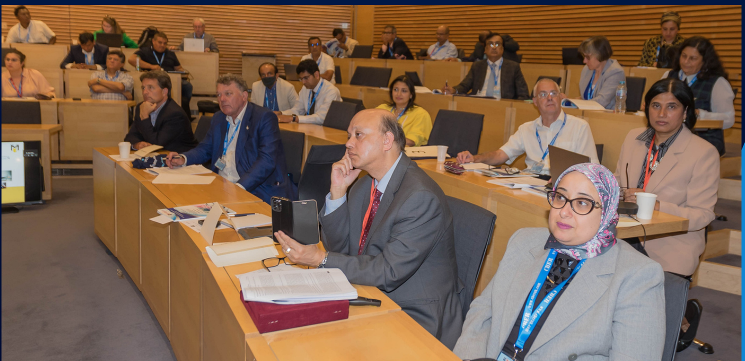
11th International Conference on the Restructuring of the Global Economy (ROGE) 2022

Executive Chair, Centre for Business & Economic Research (CBER)