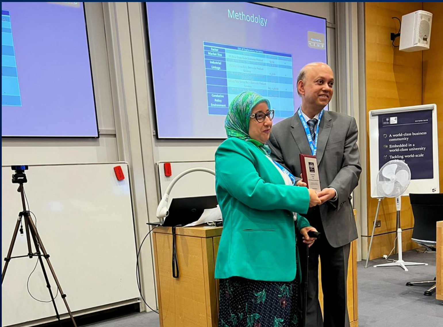
11th International Conference on the Restructuring of the Global Economy (ROGE) 2022

Join the discussion with the CBER members on Join CBER Group on LinkedIn "Like" CBER on Facebook Follow CBER on Twitter