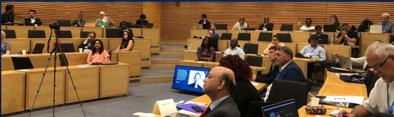
11th International Conference on the Restructuring of the Global Economy (ROGE) 2022