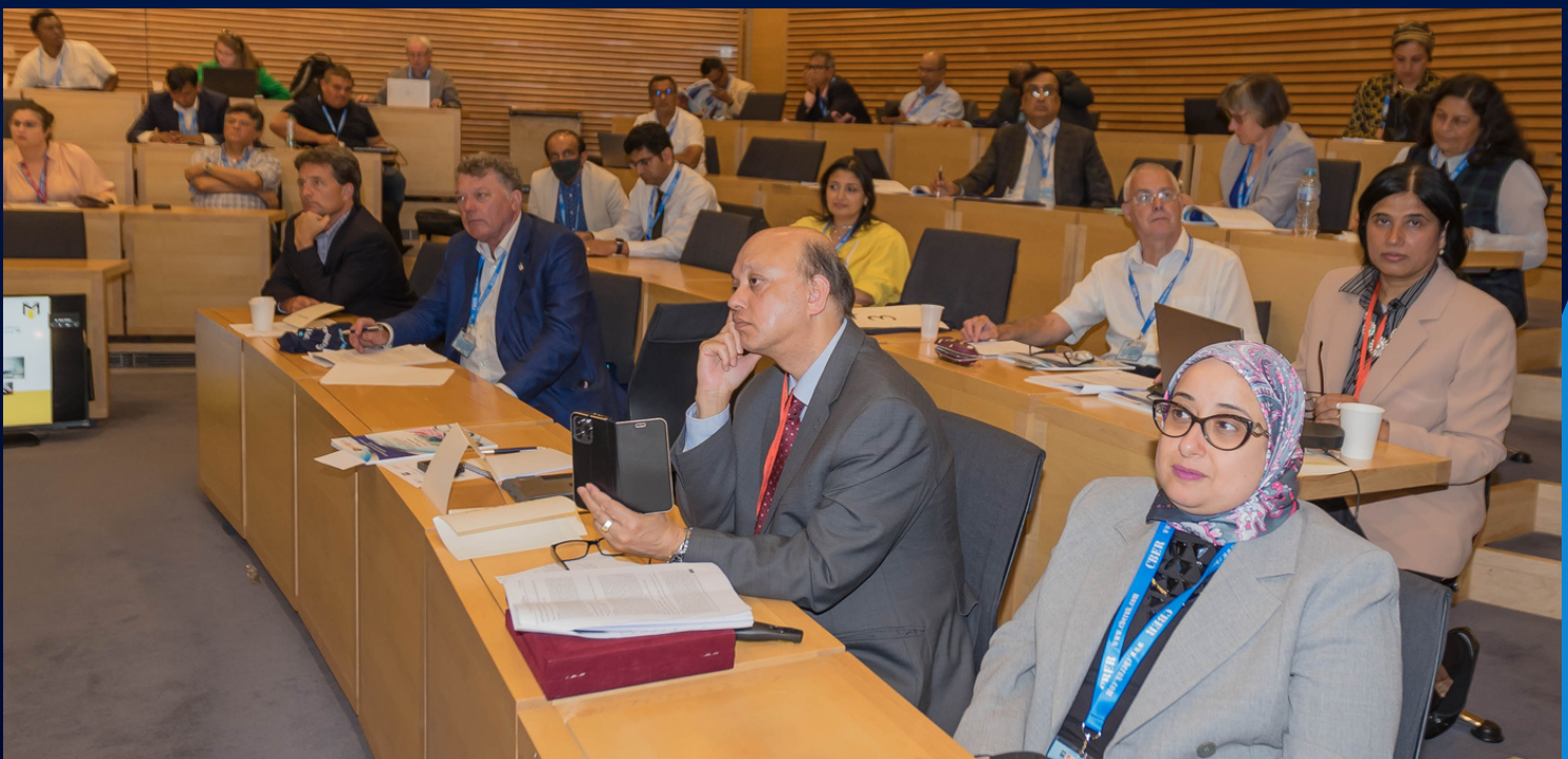
11th International Conference on the Restructuring of the Global Economy (ROGE) 2022

Senior Lecturer & Scholarship Lead, Regent College London and Executive Chair, Centre for Business & Economic Research (CBER)