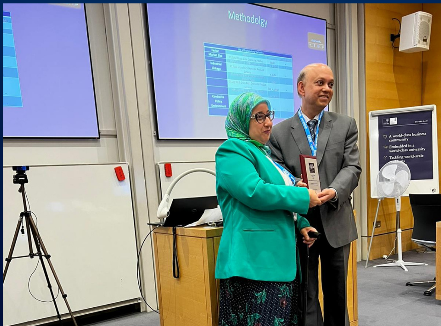
11th International Conference on the Restructuring of the Global Economy (ROGE) 2022

Join the discussion with the CBER members on Join CBER Group on LinkedIn "Like" CBER on Facebook Follow CBER on Twitter