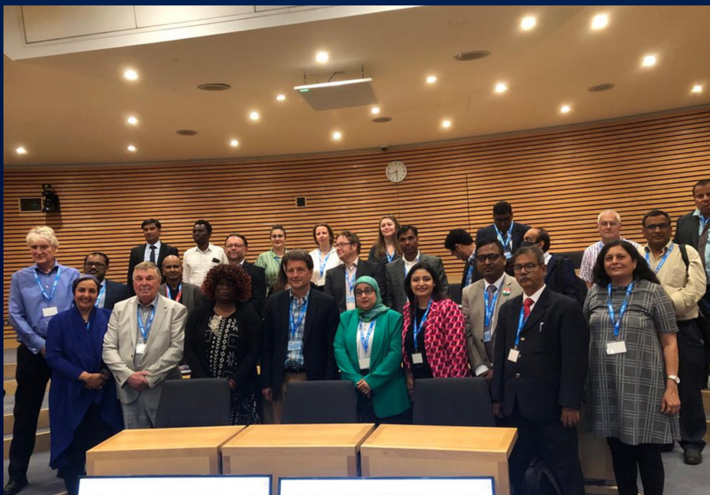
11th International Conference on the Restructuring of the Global Economy (ROGE) 2022

www.starbboxford.co.uk www.cheapoxfordhostels.co.uk