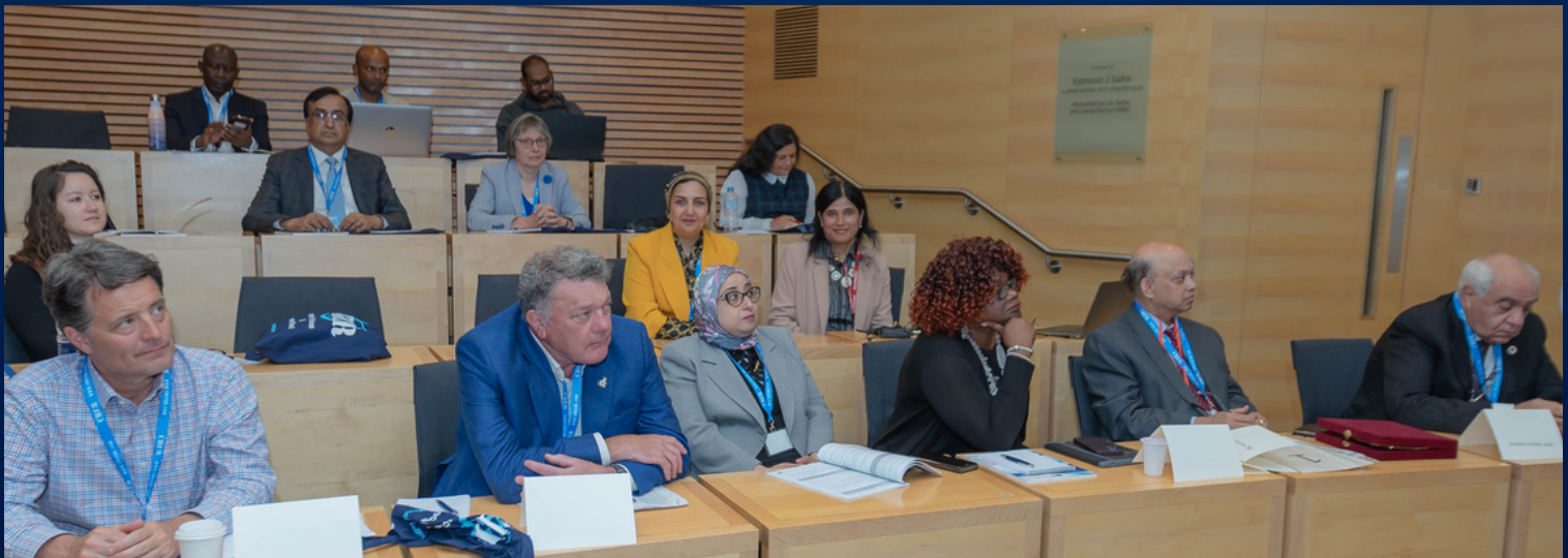
11th International Conference on the Restructuring of the Global Economy (ROGE) 2022

UNIVERSITY OF OXFORD, SAID BUSINESS SCHOOL, PARK END STREET, OXFORD OX1 1HP