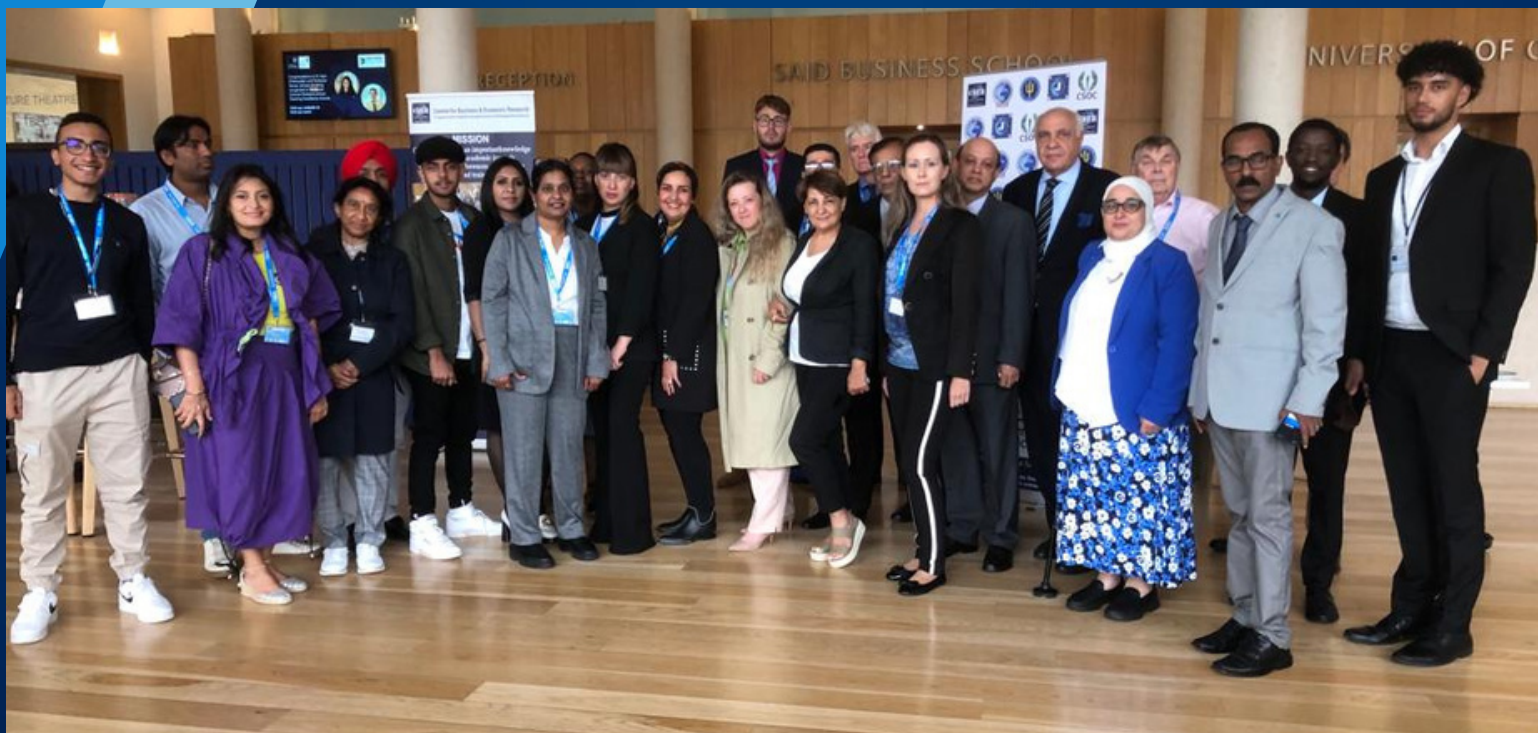
ROGE August-2023 Oxford