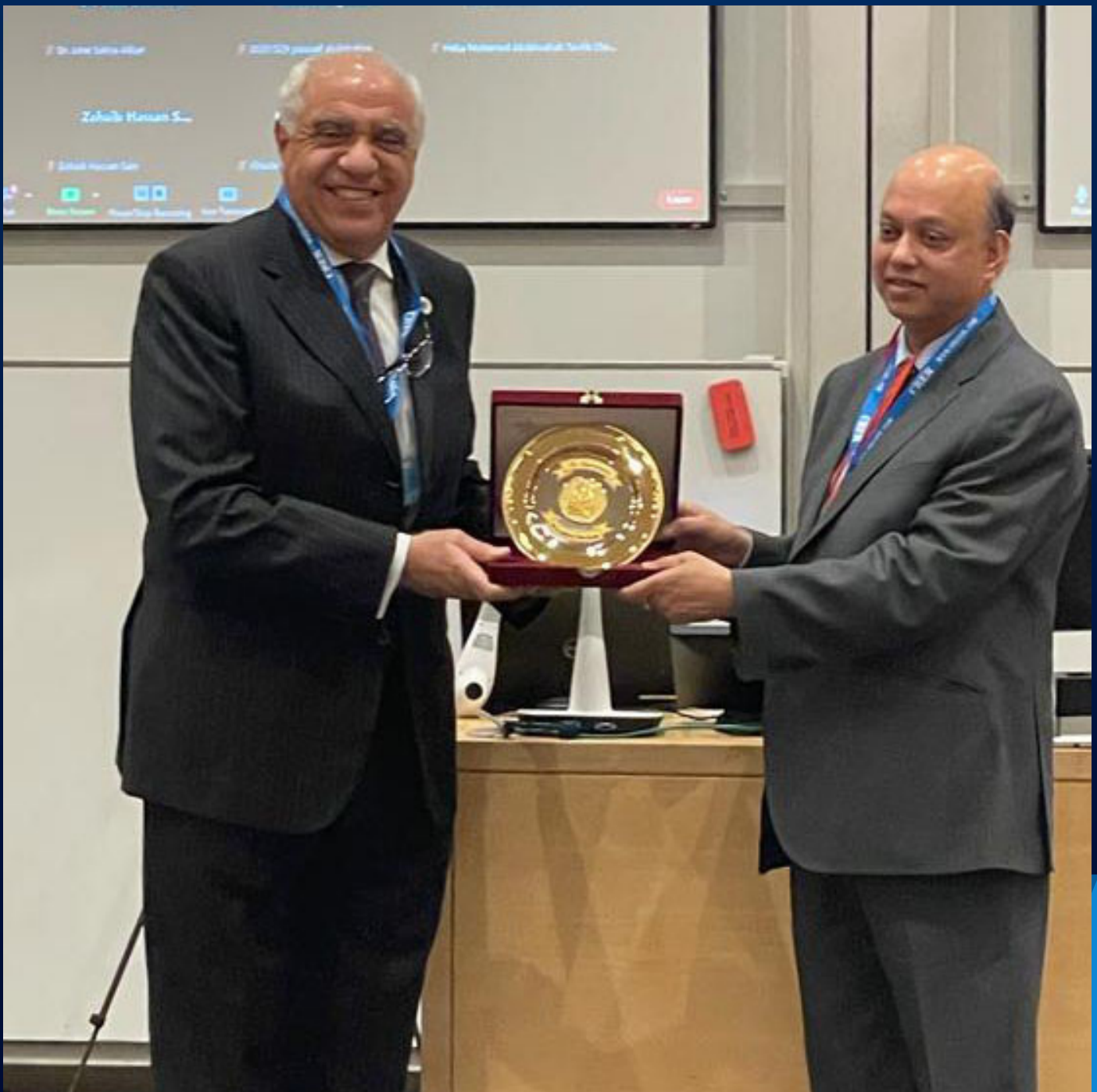
11th International Conference on the Restructuring of the Global Economy (ROGE) 2022