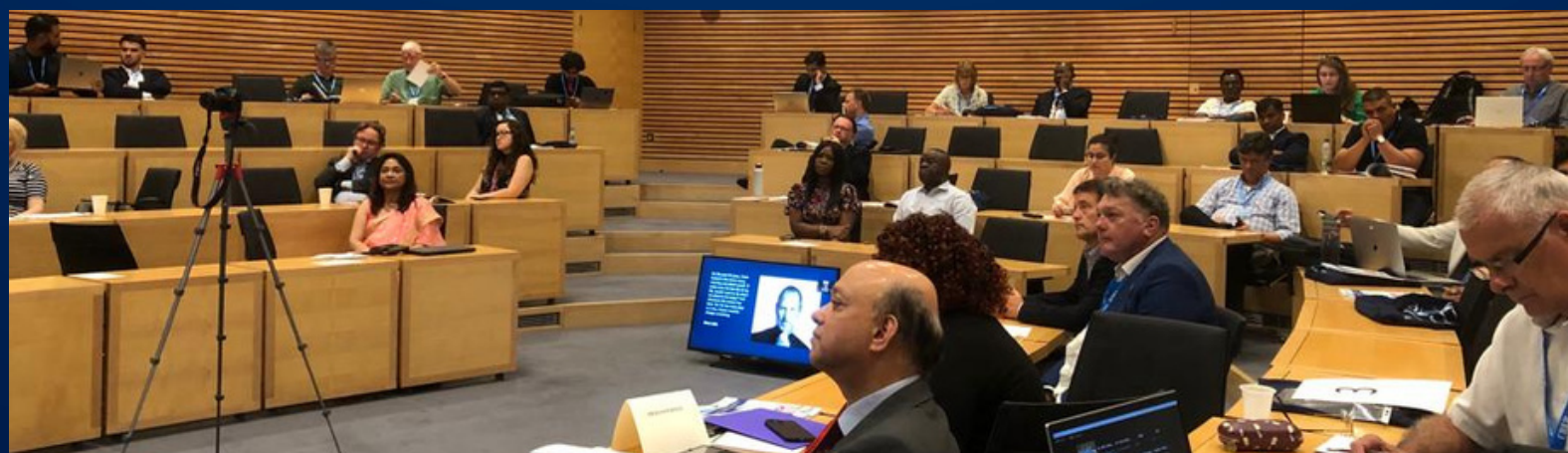
11th International Conference on the Restructuring of the Global Economy (ROGE) 2022