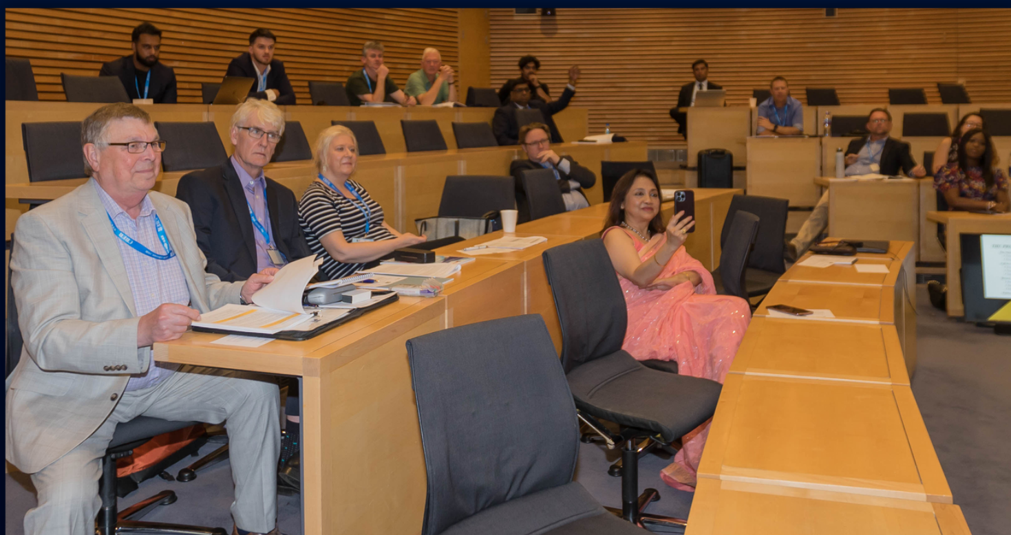
11th International Conference on the Restructuring of the Global Economy (ROGE) 2022

Authors are invited to submit their original research papers, conceptual papers, case studies, reviews, work in progress, reports, abstract, students' papers or research proposals.