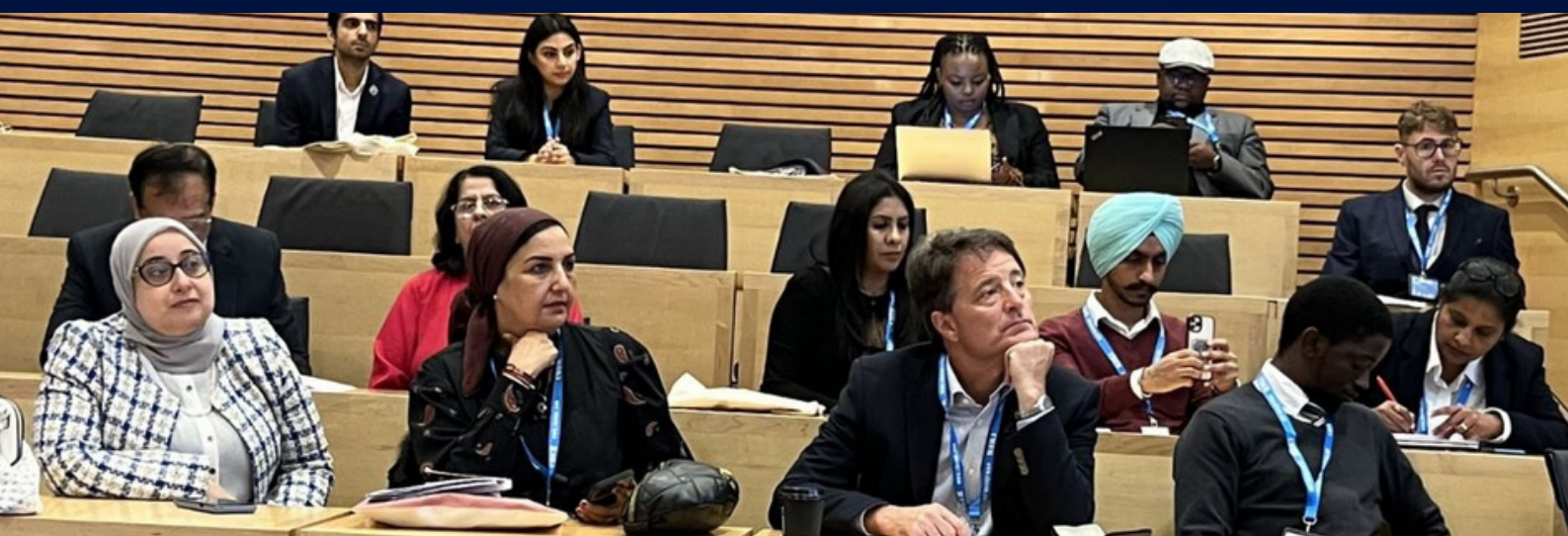
ROGE-2023 at the University of Oxford

We must all be open to new ideas. Unfortunately, many of us have allowed ourselves to become ideologically/intellectually cocooned, to the point where some of us have yet to comprehend how events such as the Brexit result and similar momentous events came about. This conference provides an excellent opportunity for us to broaden our horizons.