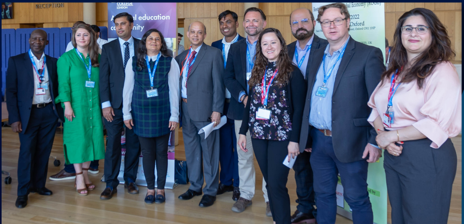
11th International Conference on the Restructuring of the Global Economy (ROGE) 2022

The maximum benefit of attending this international conference shall be to researchers, academics, management consultants, corporate professionals, corporate trainers, government officials, representatives of think tanks, social service organizations, entrepreneurs, doctoral and master's students.