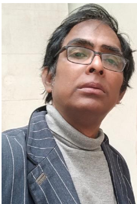
Keynote speaker and panelist