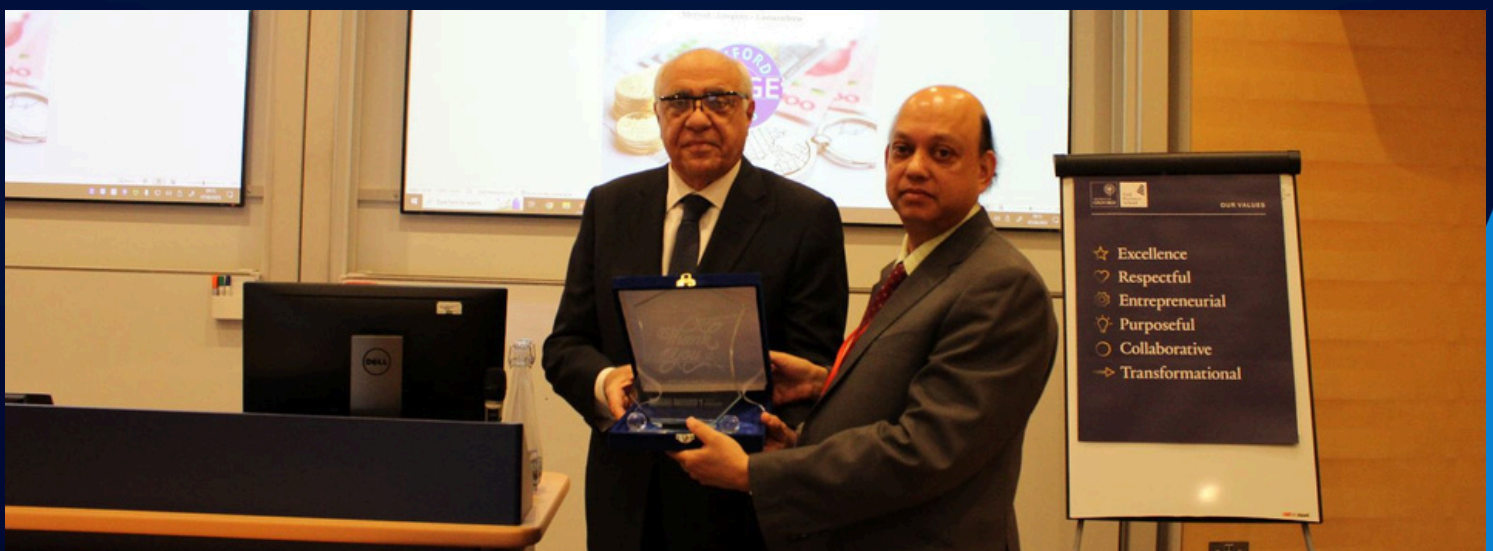
11th International Conference on the Restructuring of the Global Economy (ROGE) 2023

Scholarship Lead and Senior Lecturer, School of Business, Regent College London, UK, Executive Chair, Centre for Business & Economic Research (CBER), UK