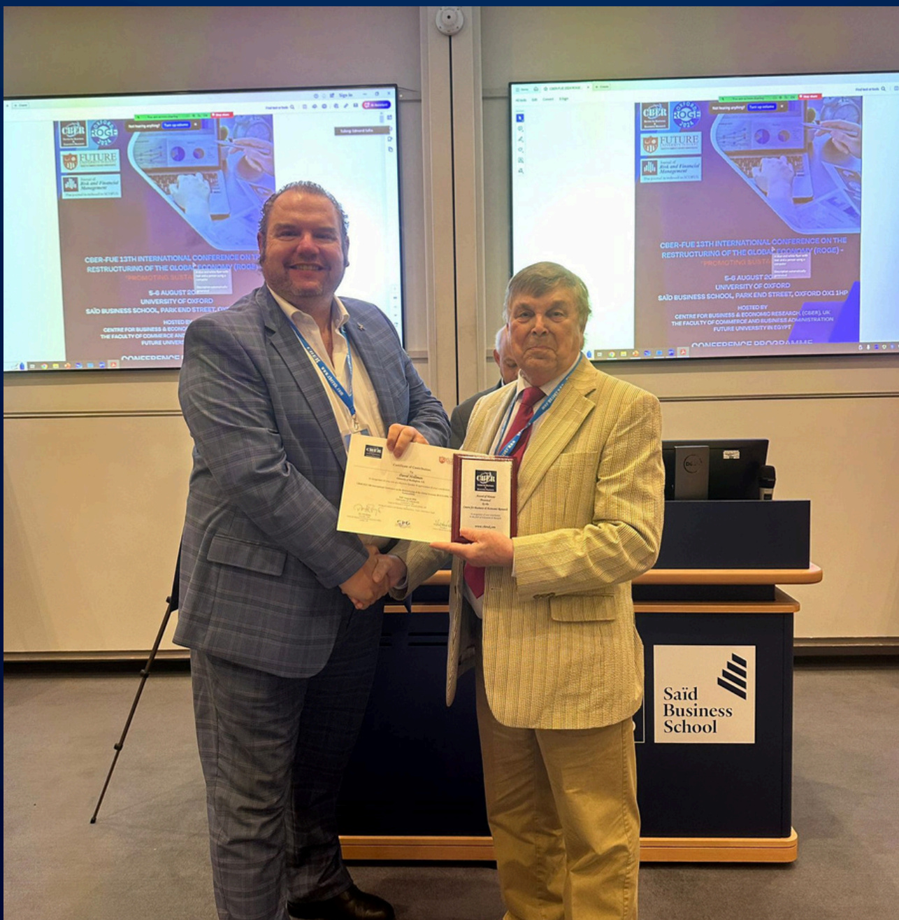
11th International Conference on the Restructuring of the Global Economy (ROGE) 2022