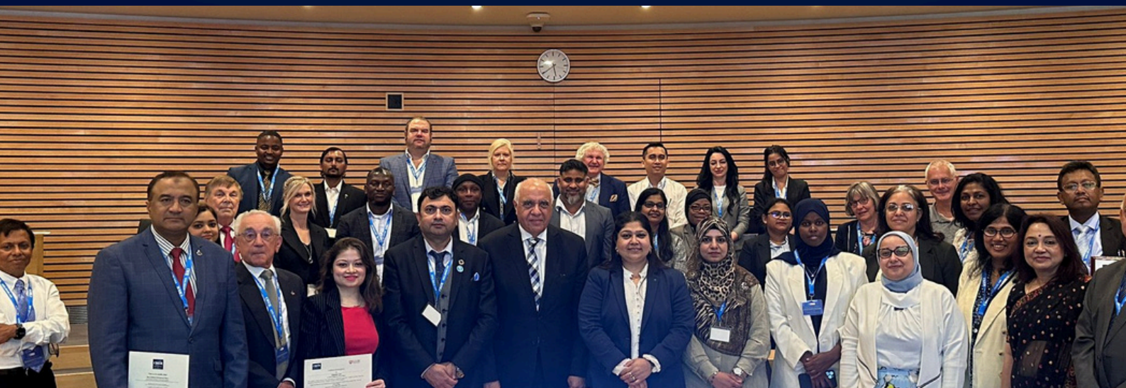
ROGE-2023 at the University of Oxford

We all need to be receptive to new ideas. Sadly, in some respects many of us have allowed ourselves to become ideologically/intellectually cocooned, so much so that some of us have yet to comprehend how the likes of the Brexit result and similar momentous events came about. This conference is an important opportunity to broaden our horizons.