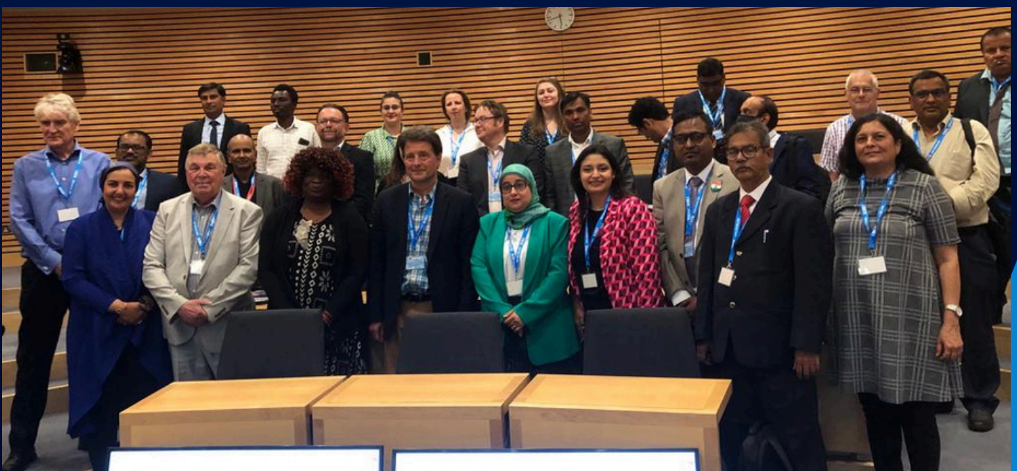
11th International Conference on the Restructuring of the Global Economy (ROGE) 2022

www.starbboxford.co.uk www.cheapoxfordhostels.co.uk