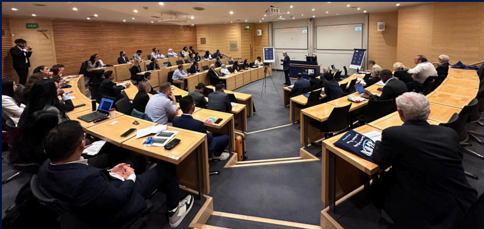
11th International Conference on the Restructuring of the Global Economy (ROGE) 2022

Join the discussion with the CBER members on Join CBER Group on LinkedIn "Like" CBER on Facebook Follow CBER on Twitter