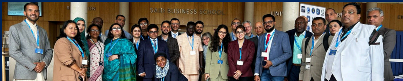
14th International Conference on the Restructuring of the Global Economy (ROGE) 2025