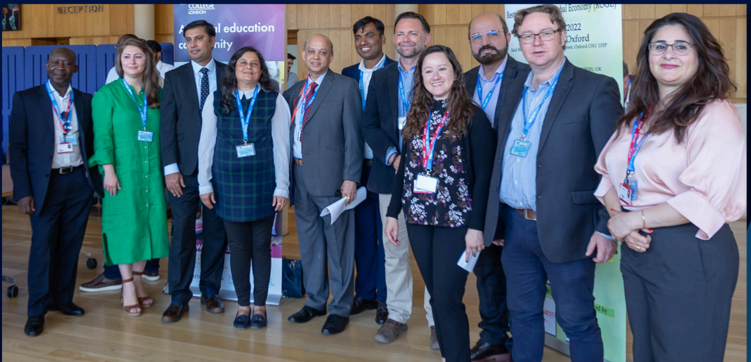
11th International Conference on the Restructuring of the Global Economy (ROGE) 2022

The maximum benefit of attending this international conference shall be to researchers, academics, management consultants, corporate professionals, corporate trainers, government officials, representatives of think tanks, social service organizations, entrepreneurs, doctoral and master's students.