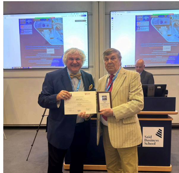
ROGE 24, OXFORD, UK