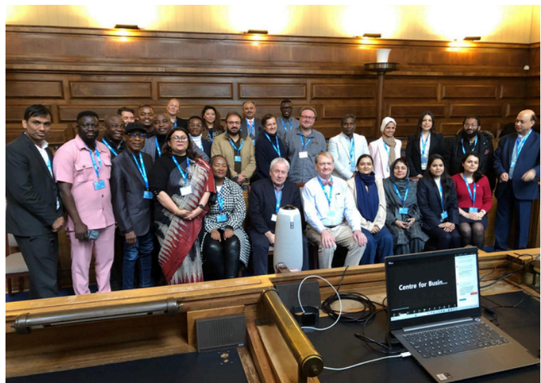
ICGEEE December 2025, University of London, UK